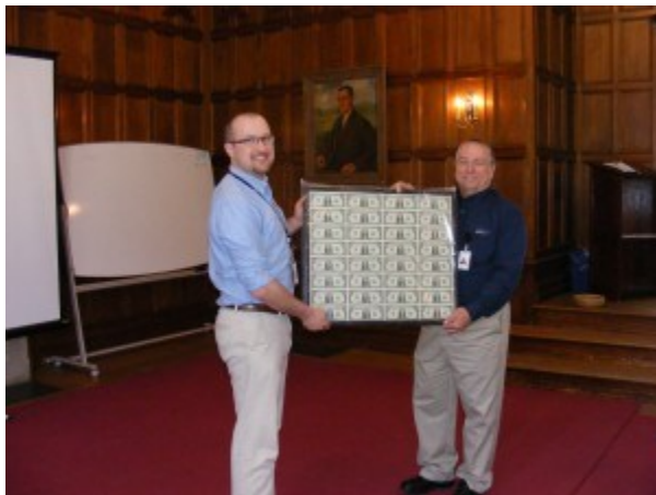
Door Prize Presentation

A tour was then given of the paper mill showcasing most of the unique and fascinating process involved with creating the paper used for our United States currency (sorry, no photos due to Security protocol).